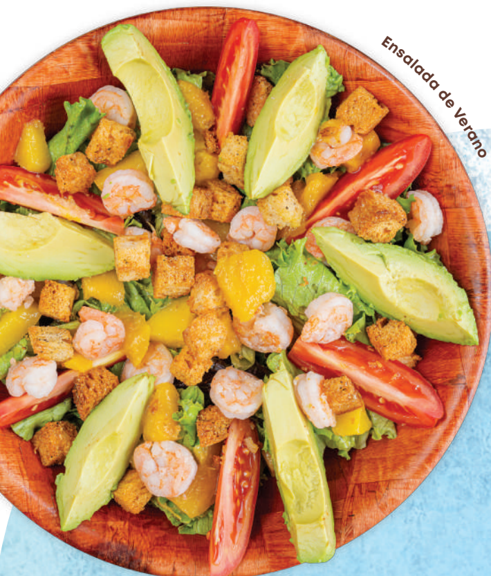
Ensalada de Verano